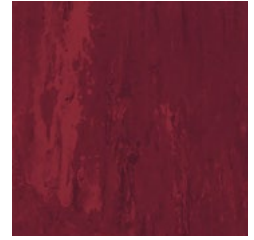
Black Cherry 8580 w/r 8580 NCS S 5030-R LRV 9