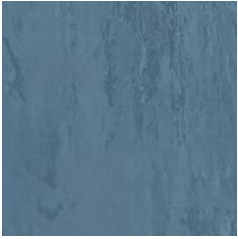
Atlantic Blue 9170 w/r 9170 NCS S 4020-R90B LRV 23