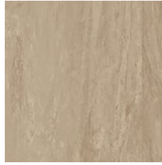
Mushroom 9110 w/r 9110 NCS S 3010-Y30R LRV 40 ■ +