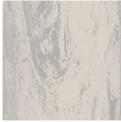
Polar Grey 9340 w/r 9340 NCS S 2002-Y50R LRV 54 ■ ■ +