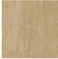
Desert Sand 9180 w/r 9180 NCS S 3020-Y10R LRV 37