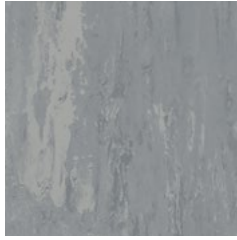
Slate Grey 9200 w/r 9200 NCS S 4000-N LRV 32 ■ ■ +