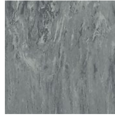
Graphite 9120 w/r 9120 NCS S 4502-G LRV 28 ■ ■ +