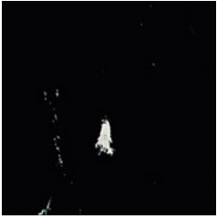
Black Panther 8640 w/r 8640 NCS S 8502-R LRV 6