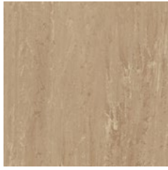
Brecon Beige 7040 NCS S 4010-Y10R LRV 32