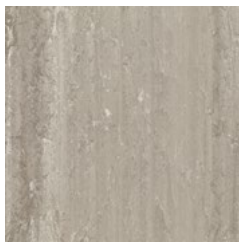
Pennine Fawn 7030 NCS S 3005-Y50R LRV 38