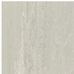
Border Grey 7110 NCS S 2502-Y LRV 50