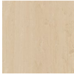
Durham Fawn 7400 NCS S 2010-Y40R LRV 47