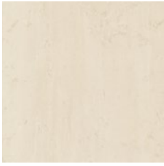
Arran Beige 7420 NCS S 1505-Y30R LRV 58