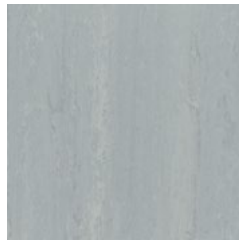
Mourne Grey 7310 NCS S 3502-B LRV 35