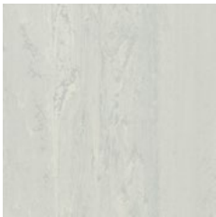
Dover Grey 7330 NCS S 2002-G50Y LRV 58