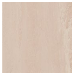
Wensley Beige 7390 NCS S 2010-Y80R LRV 48