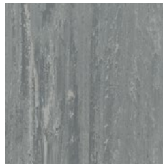
Firth Grey 7060 NCS S 5000-N LRV 26