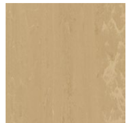
Avon Sand 7080 NCS S 3020-Y10R LRV 37