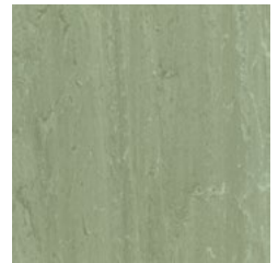
Cotswold Green 7010 NCS S 4010-G30Y LRV 30