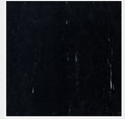
Black Tulip 6040 NCS S 8502-R LRV 5