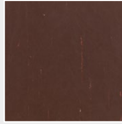
Dark Brown 6300 NCS S 8005-Y80R LRV 8