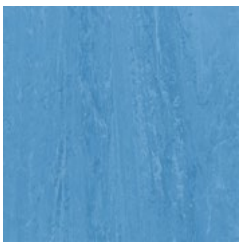
Lakeland Blue 7350 NCS S 3040-R90B LRV 26