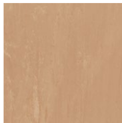
Jersey Tan 7410 NCS S 3020-Y40R LRV 34