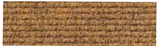
Natural (available in sheet only)