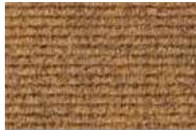
MW Rib HD Natural