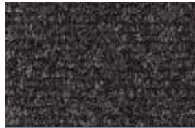
MW Rib HD Anthracite