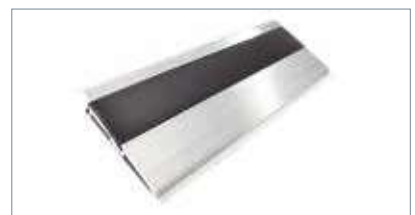
MW Ramp System