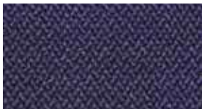
Premier Dark Blue