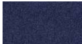
Workspace Entrance Viscount