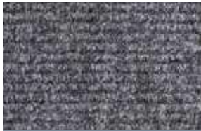
MW Rib HD Light Grey