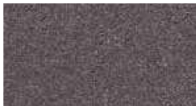
Workspace Entrance Victor