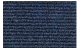
MW Rib HD Deep Blue