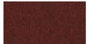
Workspace Entrance Vixen