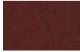
Workspace Entrance Vixen