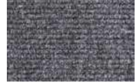
MW Rib Light Grey