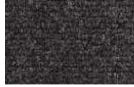
MW Rib Anthracite