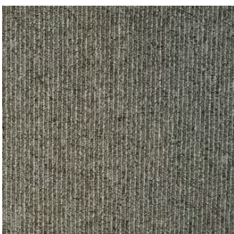
925 Brown / Smoke Grey