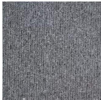
945 Graphite / Soft Grey