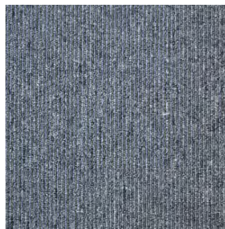
375 Sky Blue / Graphite