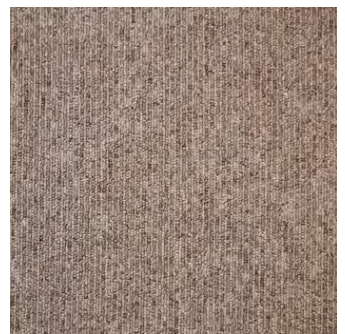
825 Crimson / Dark Brown