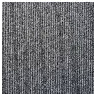
955 Graphite / Smoke Grey