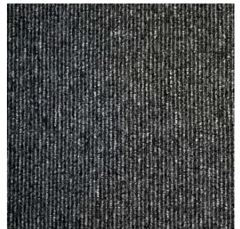
985 Black / Smoke Grey