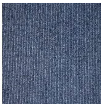
365 Sky Blue / Sea Blue